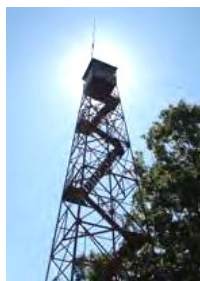
State Park Fire Tower, a great place to enjoy the fall colors