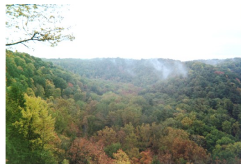
Clear Fork Gorge Overlook

colors at the top, middle and bottom of the Gorge.