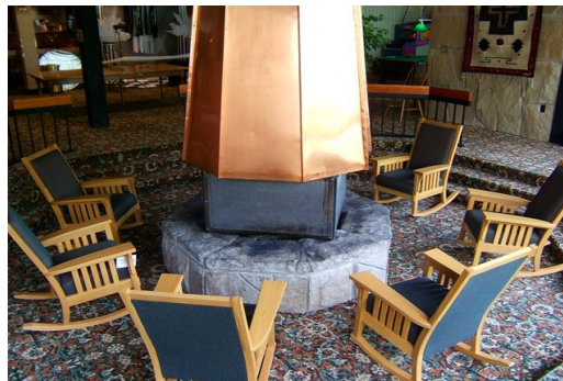
Mohican State Park Resort

CABINS From basic to deluxe screen tv's, whirlpools, with flat screen tv's, whirlpools, some with river or water