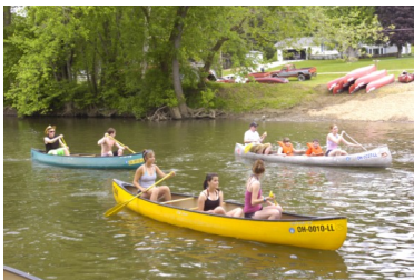
Canoeing on the Mohican River