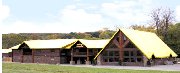
50 years later Mohican Adventures today

Fifty years old this year! Located on S. Market, State Route 3 just south of